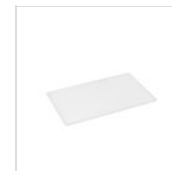
FANTASY white PE element GN 1/1 INSERT08