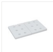
FANTASY ice pack GN 1/2 ICEPACK GN12

For manufacturing necessities, the mentioned specifications are not binding and could be changed without prior notice. Sales conditions are available upon request. Being wood a natural product, the shown colors are only indicative. Possible color and grain differences in comparison with samples and previous shipments are not reasons for claim. All parts and materials with direct food contact have been tested and approved for food contact according to the rules established by law. All rights reserved - ©Ze Pé.