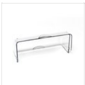
FANTASY roll top cover GN 1/1 without mounting system CLOCHE GN