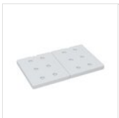
FANTASY ice pack GN 1/2 ICEPACK GN12

For manufacturing necessities, the mentioned specifications are not binding and could be changed without prior notice. Sales conditions are available upon request. Being wood a natural product, the shown colors are only indicative. Possible color and grain differences in comparison with samples and previous shipments are not reasons for claim. All parts and materials with direct food contact have been tested and approved for food contact according to the rules established by law. All rights reserved - ©Ze Pé.