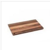
FANTASY wooden element GN 1/1 INSERT10

For manufacturing necessities, the mentioned specifications are not binding and could be changed without prior notice. Sales conditions are available upon request. Being wood a natural product, the shown colors are only indicative. Possible color and grain differences in comparison with samples and previous shipments are not reasons for claim. All parts and materials with direct food contact have been tested and approved for food contact according to the rules established by law. All rights reserved - ©Ze Pé.