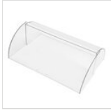
Roll top cover - rectangular for trolleys