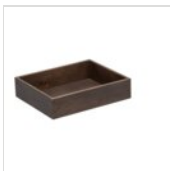
WOODEN DISPLAY GN 1/2 82100015