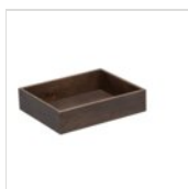
WOODEN DISPLAY GN 1/2 82100015