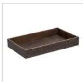
WOODEN DISPLAY GN 1/1 82100013