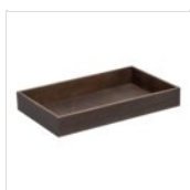
WOODEN DISPLAY GN 1/1 82100013