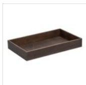
WOODEN DISPLAY GN 1/1 82100013