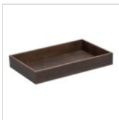
WOODEN DISPLAY GN 1/1 82100013