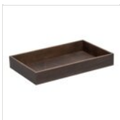
WOODEN DISPLAY GN 1/1 82100013