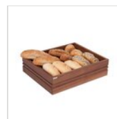
NATURE bread box GN 1/2 15A11150