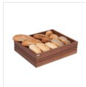
NATURE bread box GN 1/2 15A11150