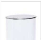
Round stainless steel lid for cereal dispenser (3L) without handle COPERCHIO 332