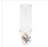
Round cereal container (3l)