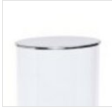
Round stainless steel lid for cereal dispenser (3L) without handle