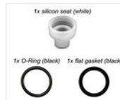
Gaskets for all faucets except RUB-ECO GUARNIZIONI SET