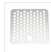
Square stainless steel drip grill 14 x 14 cm GRI-QUADRA

For manufacturing necessities, the mentioned specifications are not binding and could be changed without prior notice. Sales conditions are available upon request. Being wood a natural product, the shown colors are only indicative. Possible color and grain differences in comparison with samples and previous shipments are not reasons for claim. All parts and materials with direct food contact have been tested and approved for food contact according to the rules established by law. All rights reserved - ©Ze Pé.