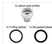
Gaskets for all faucets except RUB-ECO GUARNIZIONI SET