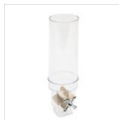
Round cereal container (3L) MULINO PACK 3L