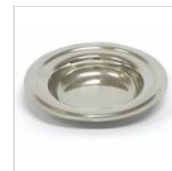
Stainless steel drip plate Ø 14 cm PIATTINO 14

For manufacturing necessities, the mentioned specifications are not binding and could be changed without prior notice. Sales conditions are available upon request. Being wood a natural product, the shown colors are only indicative. Possible color and grain differences in comparison with samples and previous shipments are not reasons for claim. All parts and materials with direct food contact have been tested and approved for food contact according to the rules established by law. All rights reserved - ©Ze Pé.