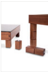
NATURE set of 12 spare legs 15K16910

For manufacturing necessities, the mentioned specifications are not binding and could be changed without prior notice. Sales conditions are available upon request. Being wood a natural product, the shown colors are only indicative. Possible color and grain differences in comparison with samples and previous shipments are not reasons for claim. All parts and materials with direct food contact have been tested and approved for food contact according to the rules established by law. All rights reserved - ©Ze Pé.